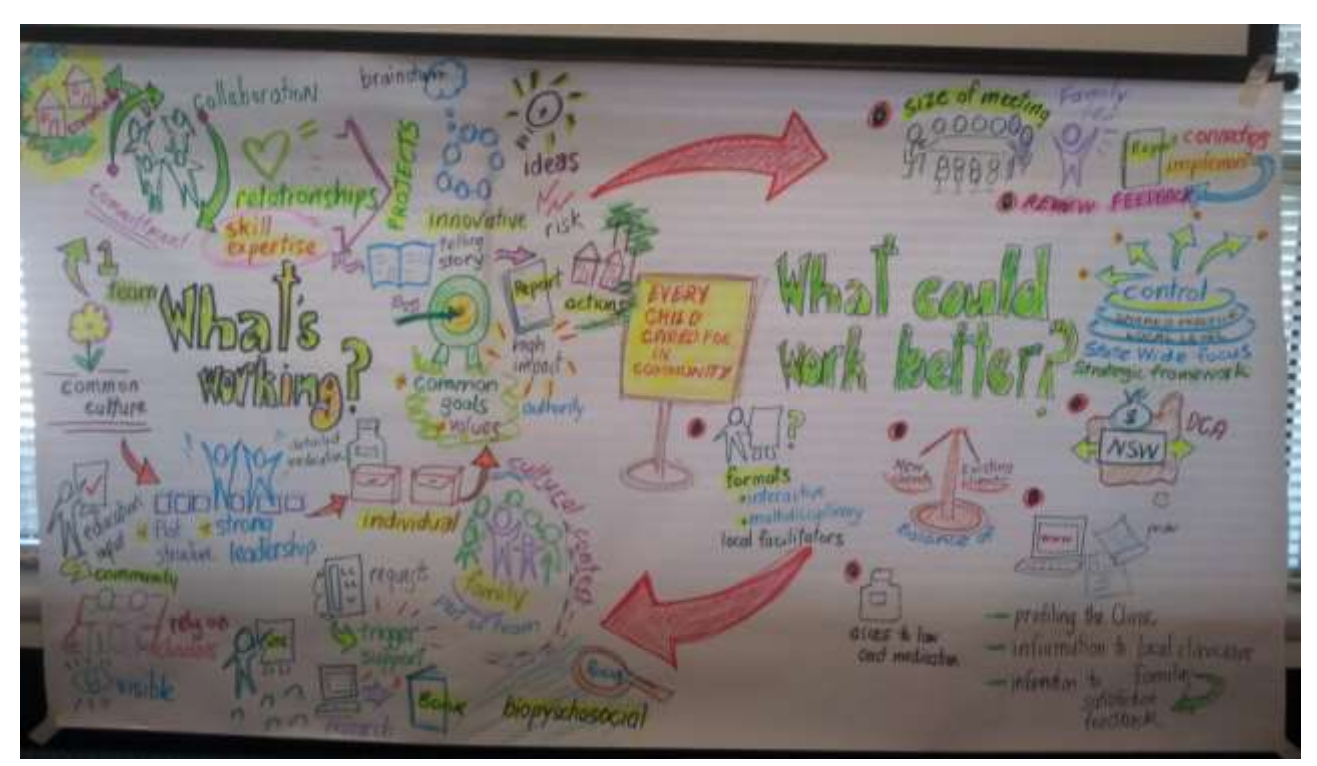
Figure 2: Graph recording of focus group

The interview and focus group material was analysed in keeping with the administration of the interview schedules and is now presented under the headings: What is working? What areas could grow? What should we do about it? Recommendations then grew out of the later two areas. The graphic recording from the focus group, presented in Figure 2, also highlights key themes.