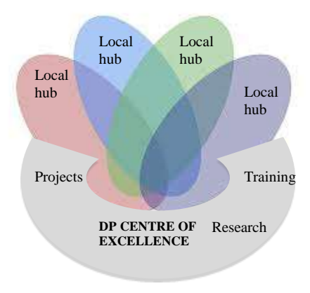
Figure 4: A DP partnership Centre for Excellence

Prior to expanding upon or making any recommendations about this model, a scan of current literature has focused on tertiary services for children and young people with intellectual disabilities who have mental health concerns. However, in sourcing literature, a range of descriptive terms was used that coupled with intellectual disability, such as behavioural difficulties, disruptive behaviour, dual diagnosis, mental health concerns, comorbidity. The literature is reported using the respective terms of the authors, laying open the opportunity for a position paper to be written that defines and distinguishes the difference between current use of such language, particularly in relation to Australian services where the term mental health appears to be used more consistently (Dossetor, White & Whatson, 2011; Torr, 2013). Further literature on evidence based collaborative practice could further enhance the model.